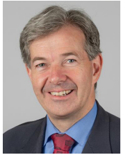
Senator John Le Fondré Chief Minister