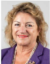
Deputy Susie Pinel Minister for Treasury and Resources