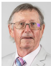
Deputy Geoff Southern Assistant Minister for Social Security