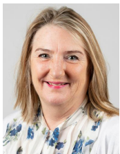
Deputy Judy Martin Minister for Social Security