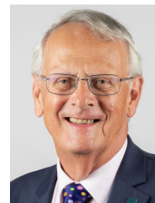
Connétable Len Norman Minister for Home Affairs