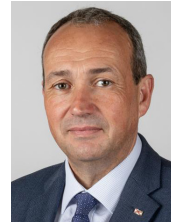
Senator Lyndon Farnham Minister for Economic Development, Tourism, Sport and Culture