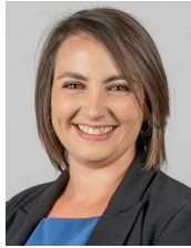
Senator Tracey Vallois Minister for Education, Deputy Chief Minister