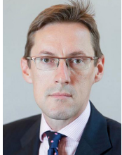
Senator Ian Gorst Minister for External Relations