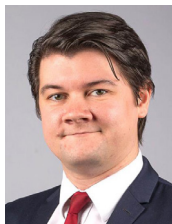
Senator Sam Mézec Minister for Children and Housing, Assistant Minister for Education