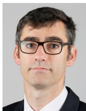
Deputy Montfort Tadier Assistant Minister for Economic Development, Tourism, Sport and Culture