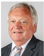
Deputy Hugh Raymond Assistant Minister for Health and Social Services, Assistant Minister for Infrastructure